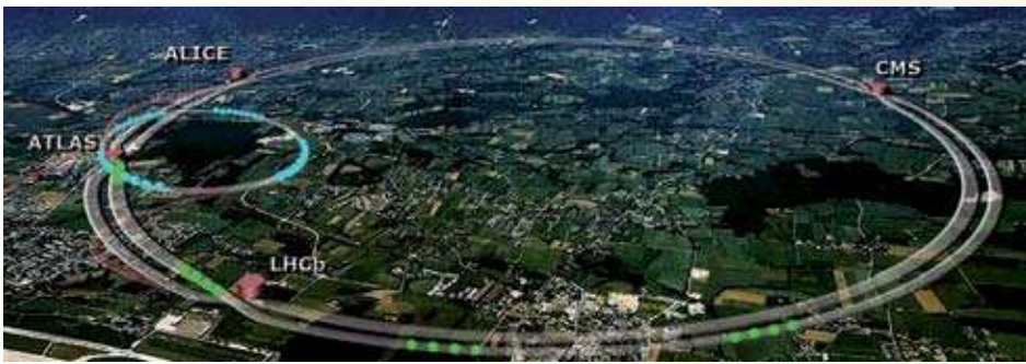
Large Hadron Collider (LHC)

medium. Peter Higgs pointed out that the mechanism required the existence of an unseen particle, which we now call the Higgs boson. The Higgs boson is the fundamental component of the Higgs medium, much as