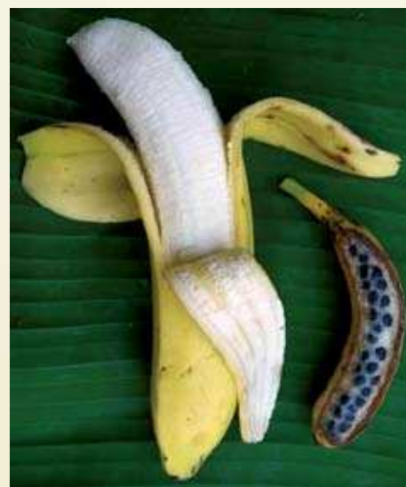
The common dessert banana (left) is shown with the seed-filled wild variety (right) that was used for genome sequencing.

Banana is an important crop in developing countries that provides food and economic security for more than 400 million people in some of the poorest parts