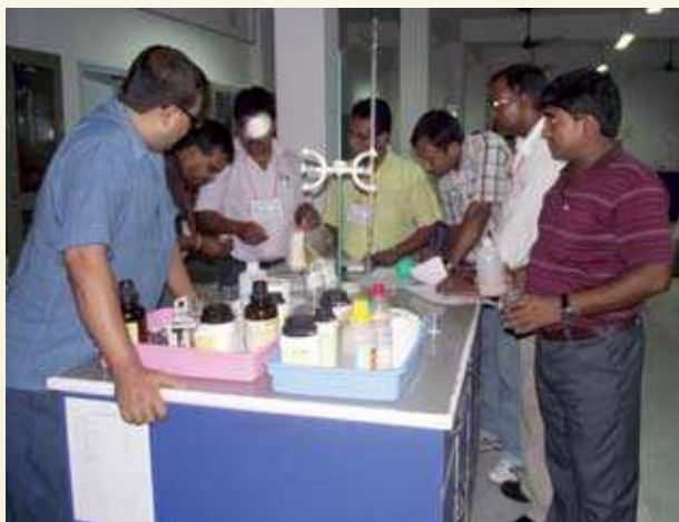
Participants doing hand-on activities during the workshop