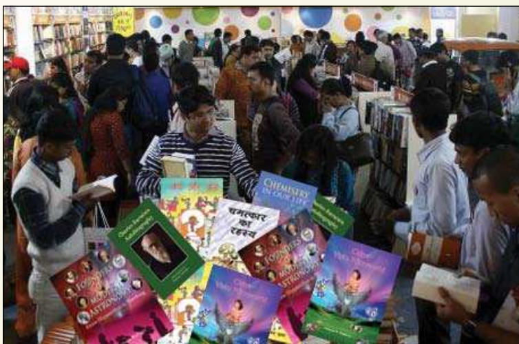
VP stall at Delhi Book Fair

In the survey a question was aimed at assessing the awareness about the term 'Scientific temper'. It was hoped that anyone who has been associated with science communication, should be aware of the