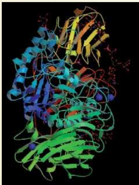
\beta -galactosidase molecule

Lactose intolerance is the most common food intolerance that affects at least one out of ten people. These people lack an enzyme called \beta -galactosidase that is essential for breaking down the lactose molecule and make it