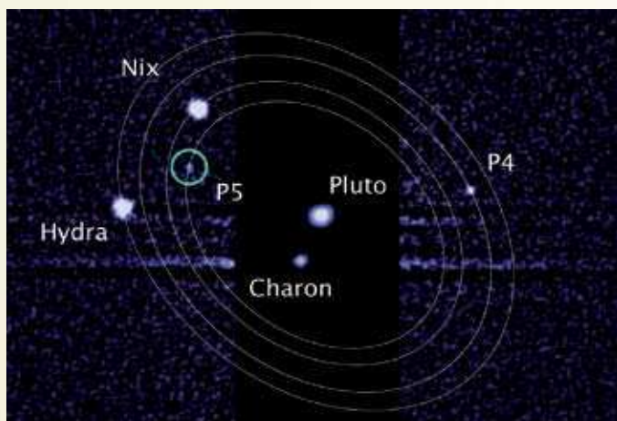
This image, taken by NASA's Hubble Space Telescope, shows five moons orbiting the distant, icy dwarf planet Pluto. The green circle marks the newly discovered moon, designated P5. The brightness of Pluto and Charon has been reduced by mask to make the smaller moons visible in the image.

All of the moons of Pluto discovered so far appear linked to the motion of the much