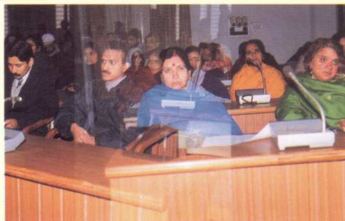
A section of the delegates attending VIPNET meeting at Meerut.