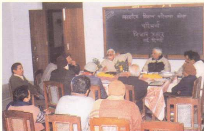
Members deliberating on the proposed Hindi Science & Technology dictionary at the Allahabad workshop.