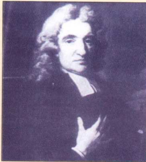
John Flamsteed (1646-1719)

on Kepler's laws. John Flamsteed (1646-1719) who became Britain's first astronomer royal took note of this book and he was impressed by Halley's work. Flamsteed encouraged Halley to take up the study of astronomy seriously. On the lines of Flamsteed, who compiled an accurate catalogue of northern stars, Halley wanted to prepare a catalogue of the stars of the southern hemisphere. With this view he sailed in a ship of the East India Company in November 1676 for the Island of St. Helena, the southernmost territory under British rule in the South Atlantic. This was possible due to the financial assistance from his father and a letter of introduction from the king. Halley spent one and a half year (1676-78) at this bleak island. The weather of the Island was harsh and inhospitable and particularly it was extremely hostile for astronomical observation. Without being frustrated by this adverse condition, Halley spent hour after hour gazing at the sky with his telescope. He was successful in listing