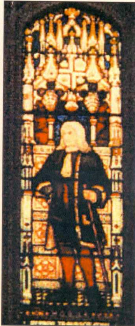
Hooke memorial window St. Helen's, Bishopgate, City of London.

1758, candid posterity will not refuse to acknowledge that this was first discovered by an Englishman." It may be noted that as time passed Halley's confidence in his own prediction gradually decreased. This was because of his increasing awareness of the problem's complexity and in particular, the role of planetary perturbations.