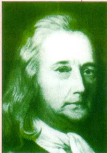
Isaac Newton in his sixty fourth year, portrait by William Gandy, 1706