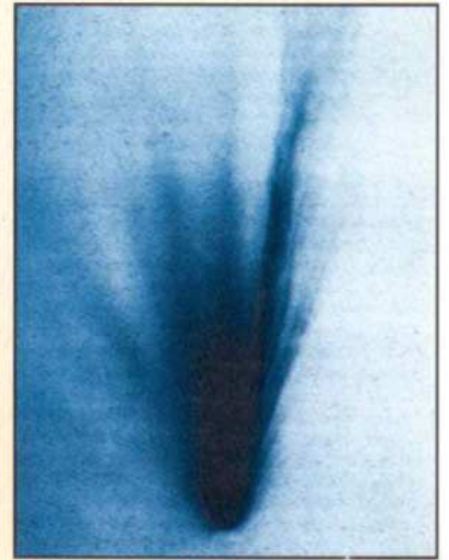
Comet Halley as it appeared on March 8, 1986

magnetic declination as a possible means for longitude measurement. He produced a world map with trade winds shown. Besides mapping magnetic declination, his expedition in the Atlantic was also concerned with determining the exact location of islands and ports. He was deeply involved in instrumentation. He developed a thermometer, a device for measuring the speed of ship through the water, and an improved version of the back staff for measuring the height of the Sun and his much talked about diving bell. He also helped Harrison to build his clock.