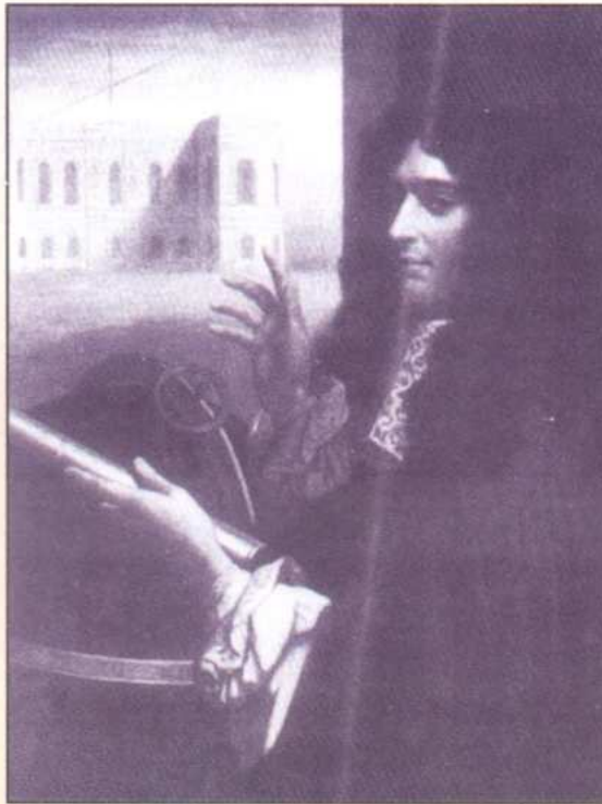
Giovanni Domenico Cassini (1625-1712)

trigonometrical method known as triangulation it was theoretically possible to measure the distance between the Earth and a nearby planet. Such an attempt was made by Giovanni Domenico Cassini (1625-1712) in 1672. He used Mars for the calculation. It may be noted here that Cassini was brought to France by Louis XIV (1638-1715), whose reign encompassed a flourishing French culture. Though he came up with a much closer figure than ever before—86 million miles against the actual distance of 93 million miles—but the problem remained far from being solved. It was Halley who pointed out that instead of Mars one should try to use Venus as the latter approaches closer to Earth than the former. But then it is rarely possible to see Venus during its closest approach to the Earth. This is because Venus