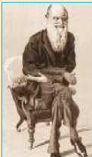
Darwin as a public figure caricature from the periodical Vanity Fair (September 30, 1871)

Darwin always referred to his Origin of Species as abstract. He wrote in its introduction: "This Abstract, which I now publish, most necessarily be imperfect. I cannot have given reference and authorities for my several statements, and I must trust to the reader reposing some confidence in my accuracy. No doubt errors will have crept in though I hope I have always been cautious in trusting to good authorities alone. I can have given only the general conclusions at which I have arrived, with a few facts in illustration, but which, I hope in most cases will suffice. No one can feel more sensible than I do of the necessity of hereafter publishing in detail all the facts, with references, on which my conclusions have been grounded; and I hope in a future work to do this. For I am well aware that scarcely a single point is discussed in this volume on which facts cannot be adduced, after apparently leading to conclusions directly opposite to those at which I have arrived. A fair result can be obtained only by fully stating and balancing the facts and arguments on both sides of each question; and this cannot possibly be here done."