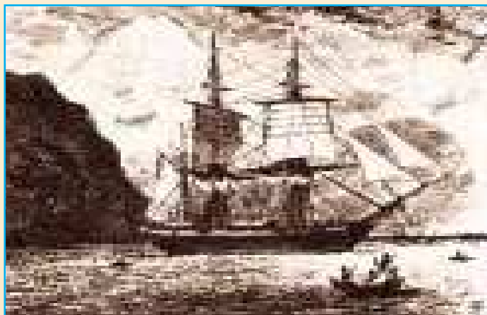
HMS Beagle is hailed by Fuegian tribesmen near the southern tip of South America

including a nine-year old girl to England. His idea was to teach them English, and the plainer truths of Christianity, reading, gardening and "the use of common tools" and subsequently return them to their homeland. FitzRoy named the girl Fuegia Basket and the other three boys were called : York Minster, Boat Memory and Jemmy Button. One of the tribal youths, called Boat Memory died soon after reaching England. Among the other three Jemmy Button and Fuegia Basket made good progress in their learning