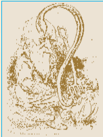
Caricature of Darwin and his earthworms that appeared in Punch magazine in 1881, the year before his death

However, Darwin took four years to write the first outline of his theory. This is because he had to collect a great deal of more data. In 1842, Darwin produced a pencil draft of thirty-five pages. By 1844 Darwin enlarged this draft to 230 pages.