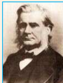
Thomas Henry Huxley

Though the debate following the publication of the Origin of Species led to wide acceptance of Darwin's theory among the scientists but it was far from being established during Darwin's lifetime. The main reason for this was that Darwin could not explain how characteristics passed on from one generation to another and why there are variations from one individual to another. Variation is found among individuals who share the same parents. It is important to note that in the successive revisions to the Origin of Species Darwin himself backed away from natural selection. In the first edition of his Descent of Man Darwin wrote : "In