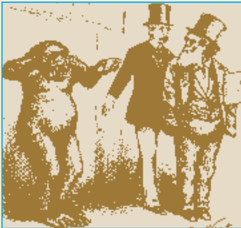
Cartoons like this one appeared in countless periodicals in Darwin's time. Here, the gorilla, pointing to the bearded Darwin, exclaims : "That man wants to claim my pedigree. He says he is one of my descendants." To which Mr. Bergb (center), founder of the society for the Prevention of Cruelty to Animals, rejoins, "Now, Mr. Darwin, how could you insult him?"

selected. Population evolve. Evolution requires genetic variation. In order to continue evolution there must be mechanism to increase or create genetic variation and mechanism to decrease it. Mutation is a change in a gene. These changes are the source of new genetic variation. Natural selection operates on this variation. Natural selection