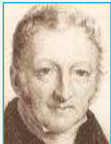
Thomas Robert Malthus

of his life's work was done. Because of his continual health problem Darwin's activities were mainly confined to writing books. The books written by Darwin are given at the end of the article. The first of his major geological works., The Structure and Distribution of Coral Reefs ", was published in 1842. In this book, Darwin presented a theory of the structure and mode of formation of coral reefs. Darwin's theory was very different from the one existed then. However, his keen observation and accurate thinking made his theory acceptable to most of the geologists. In fact his theory is even now generally accepted among geologists.