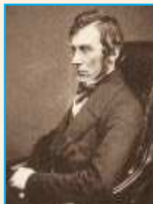
Joseph Dalton Hooker