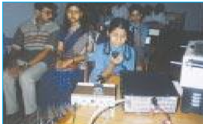
Ham Radio demonstration at "Indradhanush-2002".