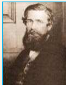
Alfred Russel Wallace

The theory of natural selection answers the question of who made the selection of what is to be evolved. The species that do survive in the competition for existence will go on to produce the next generation. The environment, an organism lives in, helps to determine which organisms survive and produce young, and which do not.