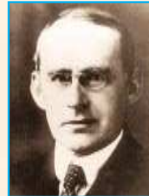
Arthur S. Eddington

Hiesenberg and Pauli spent years trying to understand why the fine structure constant was 1/137 and not, say, 1/136? They were not alone. The celebrated British astronomer and physicist Arthur S. Eddington viewed \alpha as the key to the way nature 'hangs together'. That was perhaps the reason why he was so much fascinated by the number 137; he had the habit of hanging his hat on a peg of that number in the cloakroom!