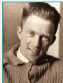
Wenner Karl Heisenberg

The clustering of dimensionless numbers into two groups of relatively narrow spread is sufficiently remarkable for us to postulate what is called a cluster hypothesis . According to this hypothesis, all dimensionless numbers compounded from the universal constants of physics are members of either the unity or the N 1 group. Other numbers, such as N 1 1/2 and N 1 2 , may be obtained from N 1 and cannot be regarded as basic in the same sense as N 1 . However, for the present, there is no theory to support the cluster hypothesis. But, presumably, the explanation may have something to do with the basic design of the universe.