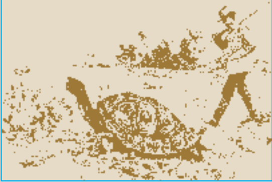
Darwin in the field on the Galapagos Islands, Measuring the speed of an Elephant tortoise

The process of evolution can be summarised in three sentences: Genes (hereditary units) mutate. Individuals are