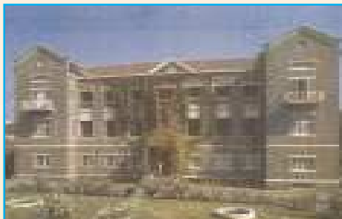
A view of main Building of Agharkar Research Institute