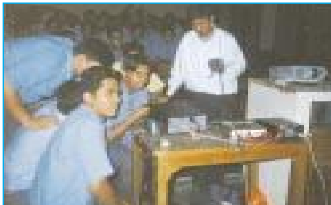
Ham Radio demonstration to Mount St. Mary's School, Delhi Cantt