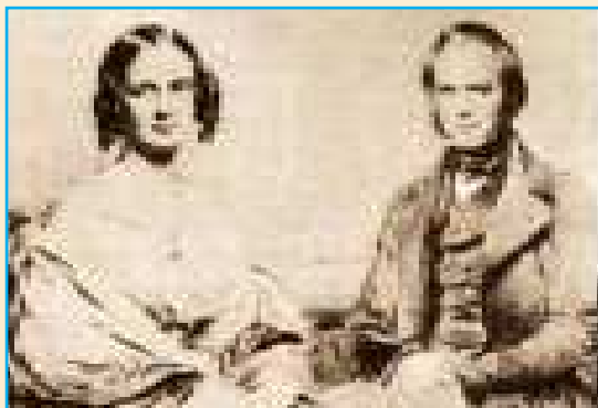
Darwin and his wife Emma (left)

the earlier editions of my " Origin of Species " I probably attributed too much to the action of natural selection or the survival of the fittest". The first reason for Darwin's retreat was the failure to explain the cause of variation, a key component in Darwin's theory of natural selection. The second important reason was the enormous timescale required for evolution. In the second half of the nineteenth century the scientists believed that the Sun could not have been hot for more than a few millions years as there was no process known to scientists which could supply energy to keep the Sun shining for hundreds of millions of years required for the variety of forms of life on Earth to have evolved through small steps. Scientists of the twentieth century have established that the long time-scale required for evolution by