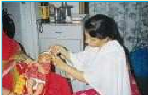
Measurement of newborns in progress

A rich library and publication activity apart, the institute has also an experimental farm near Pune, workshops and a hotlab for handling radio chemicals. In fact, about half an acre land is devoted to nursery activities. Experimental facilities, such as polyhouse, glass house and green house are available here. Two herbariums named after Dr Agharkar, which originated