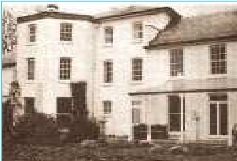
Down House - the Home of Darwins at Downe

Following the continued deterioration of his health, Darwin moved to a country residence at Downe, Kent. The home of the Darwins, Down House still stands in the village of Downe, about 23 km South of London. Darwin lived a life of a country gentleman of independent means among his gardens, conservatories, pigeons and fowls. However, he conducted extensive experiments especially in variation and interbreeding. It was at Downe that most