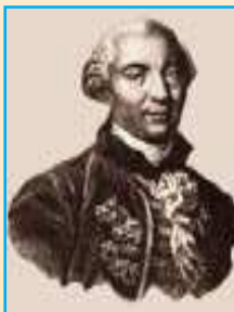
Georges Louis Leclerc, Comte de Buffon