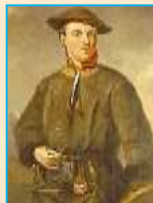
Carolus Linnaeus or Karl Von Linne