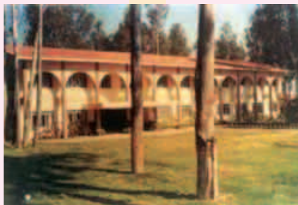
Centre for Liquid Crystal Research at Bangalore

Liquid crystal is another phase of a matter whose order is intermediate between that of a liquid and that of a crystal. The molecules in liquid crystal have no positional order. However they exhibit a certain degree of orientational order.