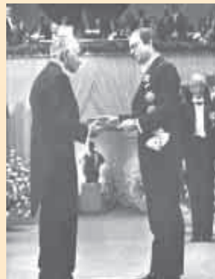
Chandra receiving the Nobel Prize in physics from King Carl XVI Gustav of Sweden, Stockholm, 1983.

experience while in Science, generally it does not. Chandra felt that we do science in isolation, focus narrowly on our immediate goals and that we are not sufficiently broad in our interests and pursuits. He feels that one would do better Science if one read Shakespeare, particularly his penultimate play, The Tempest ”.