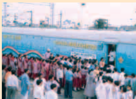
Long queues awaiting to see the Vigyan Rail at Kurukshetra