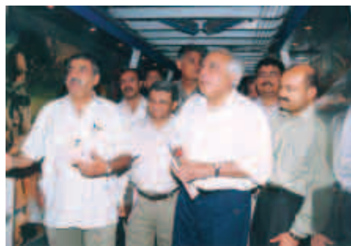
Shri Kapil Sibal, the Hon'ble Minister of State, Science and Technology and Ocean Development (Independent Charge) visiting the Vigyan Rail

Vigyan Prasar organized a get-together on August 18, 2004 to mark the end of Vigyan Rail's journey in the first phase. Hon'ble MOS Shri contd. on page...28