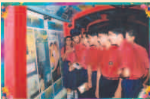
School students inside CSIR coach at Ferozepur station