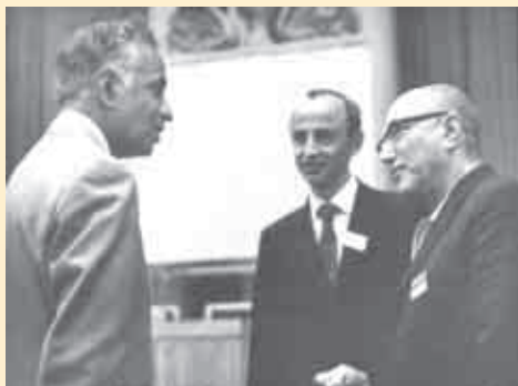
Chandra with Igor D. Novikov and Ya.B.Zeldovich, General Relativity Conference Warsaw, 1962

This is a voluminous book (XIX + 654 pages) where Chandra starts with the discussion of the classical Benard Convection problem, then generalises it to include the effect of rotation of magnetic field and then their combined effect. The problems of thermal stability in fluid spheres and spherical shells is then discussed. This is followed by the stability of couette flow and more general flows between co-axial cylinders. The