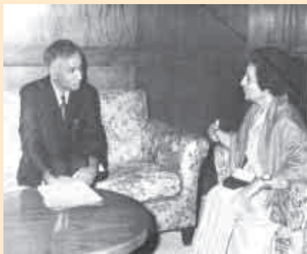
Prime Minister Indira Gandhi and Chandra on the occasion of the Second Jawaharlal Nehru Memorial Lecture which Chandra delivered, New Delhi, November 1968

"There is a kind of fineness about him" says Marvin Goldberger, both from a physical and from a philosophical point of view. He is one of the most elegant looking people I have ever met". Victor Weisskopf first met Chandra when he was a Cambridge graduate student spending a year in Niels Bohr Institute in Copenhagen in 1932. "The strange thing about Chandra is that he has changed very little. He has got white hair, but apart from that he looks to me exactly like he looked at that time. Right from the beginning, but even more later on, he became sort of the most pure example of the ideal scholar in Physics... nothing of vanity, nothing of pushiness, nothing of job seeking, publicity seeking, or even recognition seeking .... His deep education, his humanistic kind of approach to these problems, his knowledge of world literature and in particular English literature are outstanding. I mean you would hardly find another physicist or astronomer who is so deeply civilized"