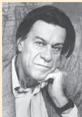
Pierre-Gilles de Gennes

This means that the molecules in liquid crystals tend to point more in one direction over time than other directions. This preferred direction is called director of the liquid crystal. Not all substances can have a liquid crystal phase. A liquid crystal is more like a liquid than it is like solid. Liquid crystal is an anisotropic material. The properties of an anisotropic material differ on what direction they are measured. An anisotropic substance means it shows different behaviour in different direction. For example, because of anisotropic property of liquid crystals, they allow light to pass through into one direction but stop it into the other. The liquid crystal molecules are typically rod-shaped organic moieties about 25 angstroms in length.