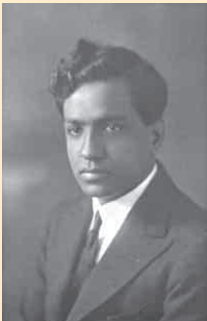
Chandra as Fellow of Trinity College, Cambridge, 1934

All of Chandra's research depended on his great mathematical powers, the ability to see his way through complicated system of integrodifferential equations and solve them. It required immense concentration, self confidence, insight and hard work, all of which he had in abundance. Many of his papers required massive numerical computations in the days before high speed digital