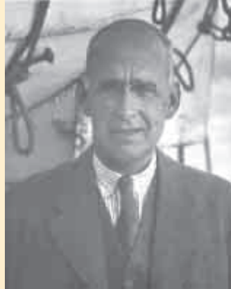
Sir Arthur Stanley Eddington (1882-1944), 1932.

In late 1941, Chandra spent one quarter at the Institute for Advanced Study at Princeton, doing joint research on complex statistical mechanical problems with John Von Neumann. They were both very powerful applied mathematicians, and as Von Neumann was one of the top theorists at Aberdeen (and in several other weapon programs as well) they continued their