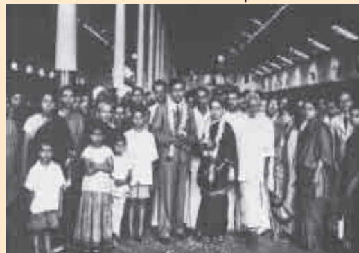
Farewell from family and friends, Madras railway station, October 1936

Black Holes are the remains of collapsed stars far larger than white dwarfs. Whereas white dwarfs shine dimly, black