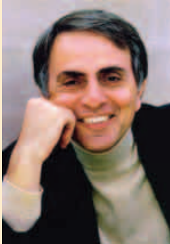
Carl E. Sagan

taken with the help of satellites revealed that, like Earth, Europa too has an icy surface. This suggested the existence of warm oceans up to a depth of about 100 kilometers beneath the icy cover which, said the scientists, could host some form of life.