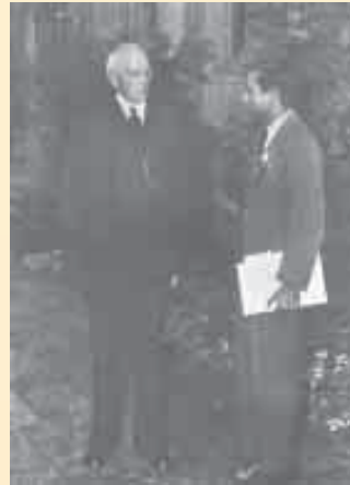
Henry Norris Russell and Chandra at a symposium to commemorate the fiftieth anniversary of the University of Chicago, September 1941

experience while in Science, generally it does not. Chandra felt that we do science in isolation, focus narrowly on our immediate goals and that we are not sufficiently broad in our interests and pursuits. He feels that one would do better Science if one read Shakespeare, particularly his penultimate play, The Tempest ”.