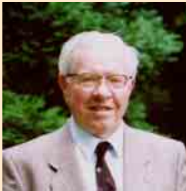
Sir Fred Hoyle

galaxy. Astronomers have been able to discover millions of galaxies of different shape and size in the entire universe. In such a vast universe containing millions of galaxies with each galaxy containing billions of stars, is it possible that origin and evolution of life took place on an ordinary planet of a star that is by no means unique? The scientists negate this by saying that it is highly implausible.