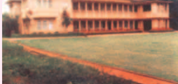
Raman Research Institute, Bangalore

liquid crystal more such synthetic crystals were produced. Today it is possible to synthesise liquid crystals with specific predetermined properties.